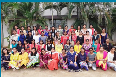
First batch of Chittoor's BSc Nursing Degree Program.