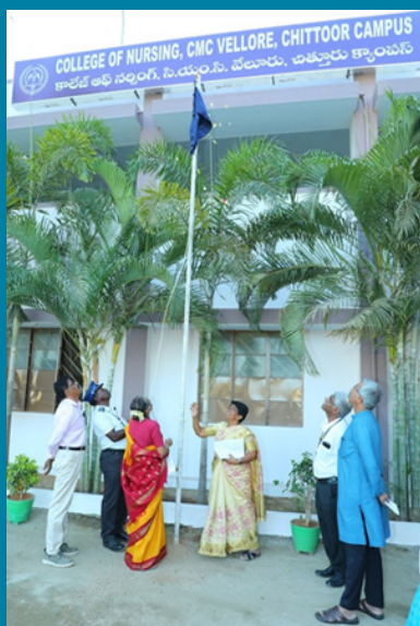
Dedication of the College of Nursing Facility, Chittoor Campus was held in February 2020