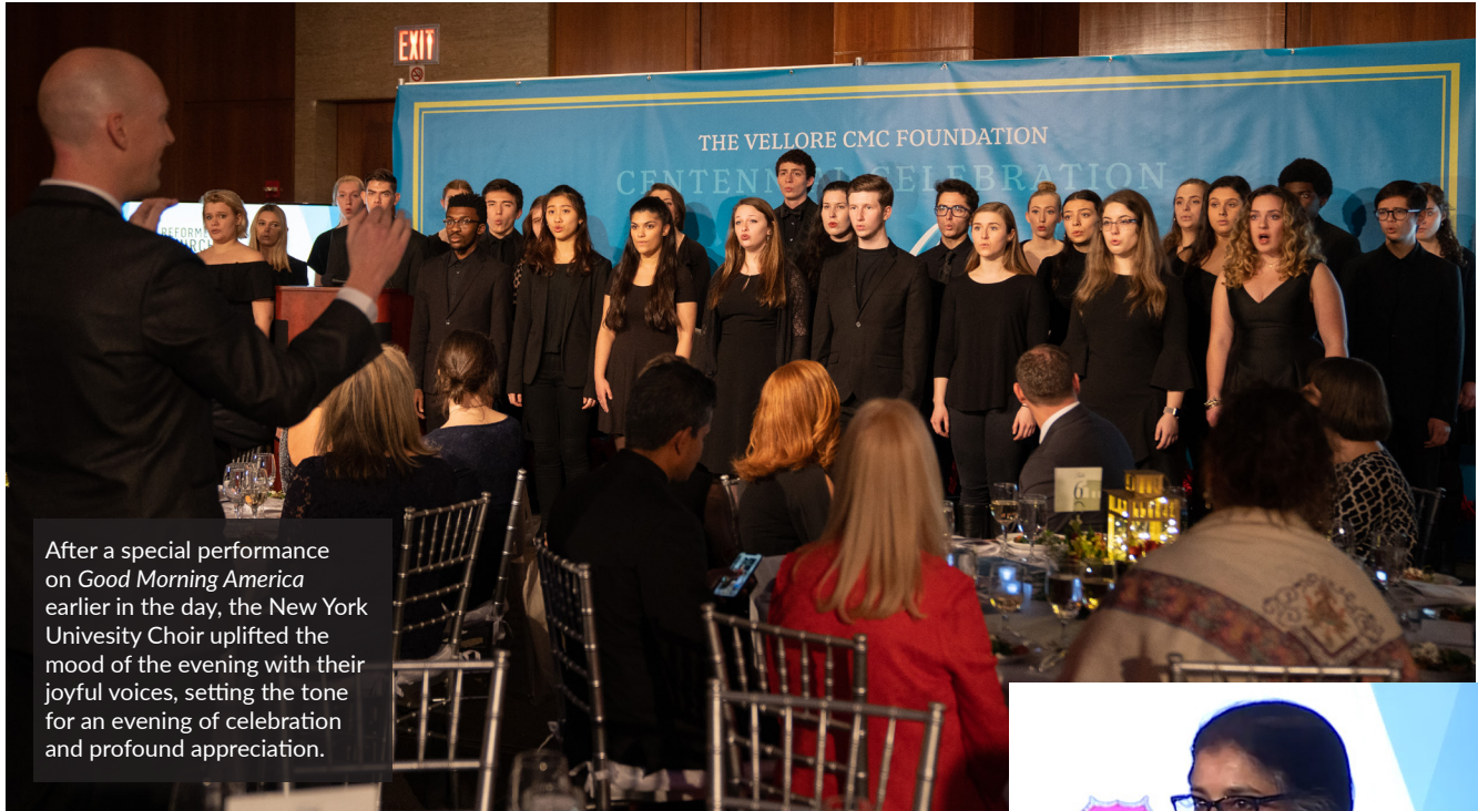
After a special performance on Good Morning America earlier in the day, the New York University Choir uplifted the mood of the evening with their joyful voices, setting the tone for an evening of celebration and profound appreciation.