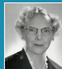
Dr. "Ida B." Scudder