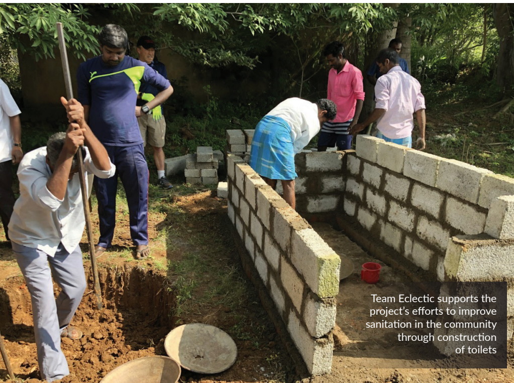
Team Eclectic supports the project's efforts to improve sanitation in the community through construction of toilets