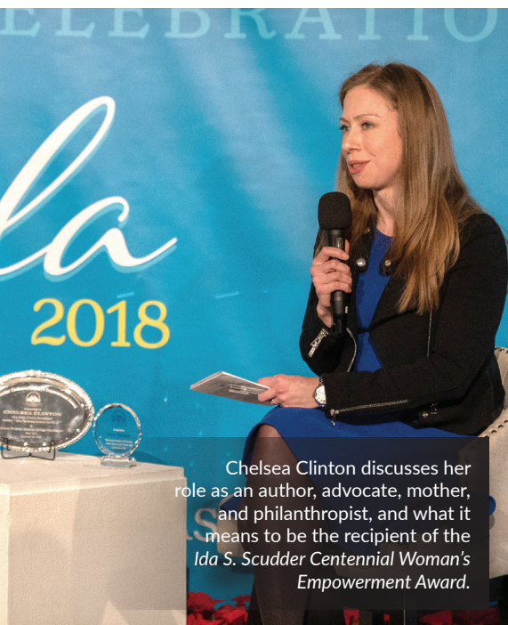
Chelsea Clinton discusses her role as an author, advocate, mother, and philanthropist, and what it means to be the recipient of the Ida S. Scudder Centennial Woman's Empowerment Award.