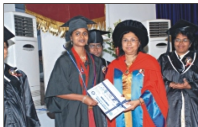
College of Nursing Graduation