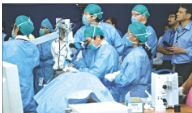
Skull Base Conference