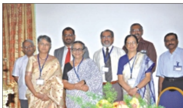
Diamond Jubilee, Department of Medicine