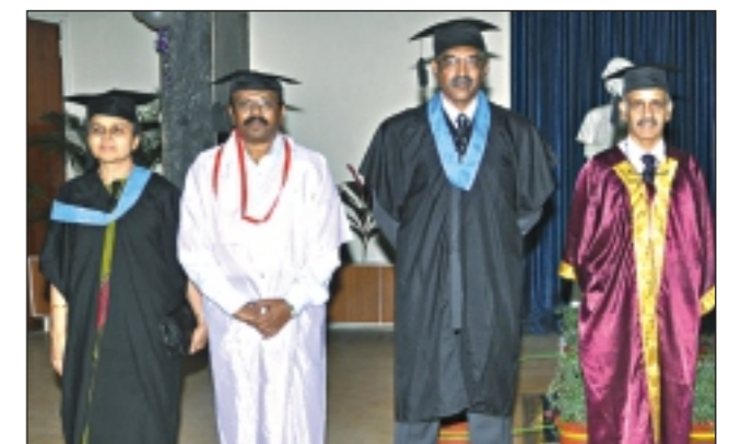
Allied Health Science Graduation