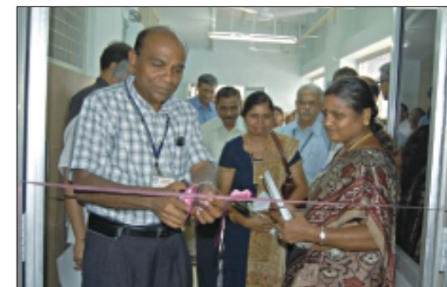
Dedication of Neuro Physiology Lab