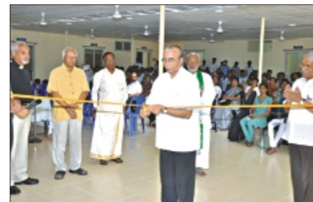
Dedication of OPD CMC Vellore, Chittoor Campus