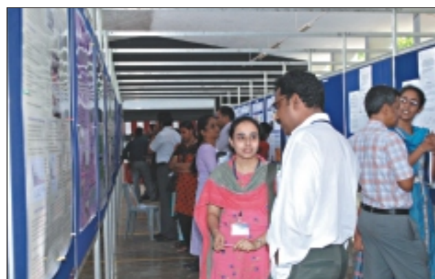
Annual Research Day