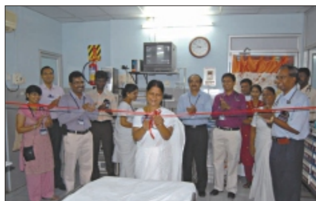
Dedication of Endobronchial Ultrasound