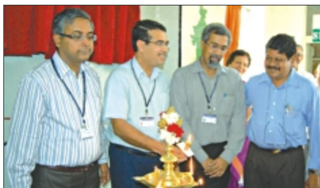
Dedication of Endo Molecular Lab