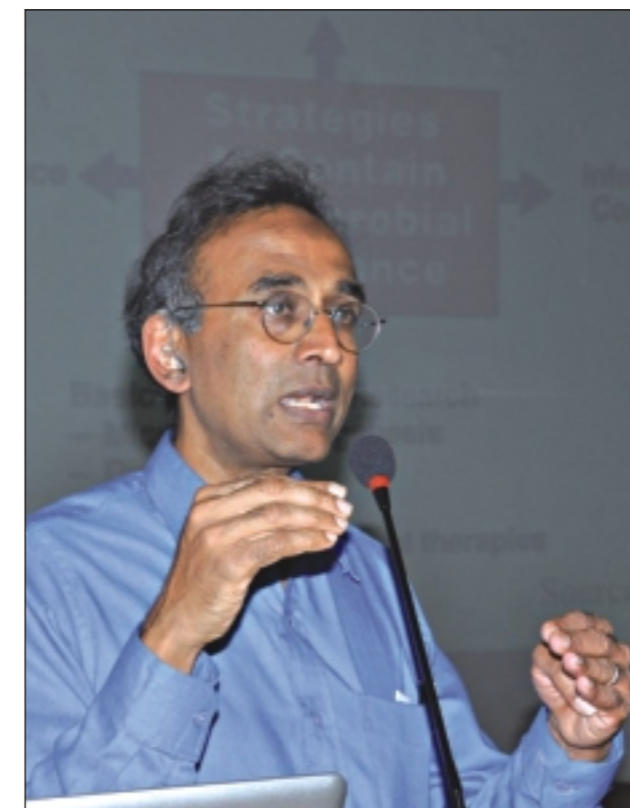
10th Winter Symposium Nobel Laureate Prof. Venkatraman Ramakrishna