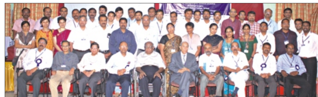
Diamond Jubilee Celebrations - Division of Surgery