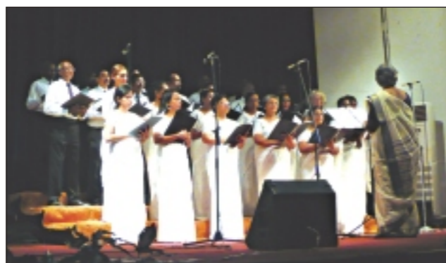
Kyrie to Calypso - Concert for PTP