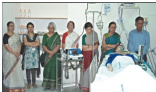
Simulation Lab - A gift from the MBBS batch of 1958-59